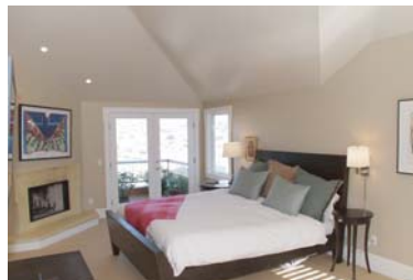
Master Bedroom with Deck